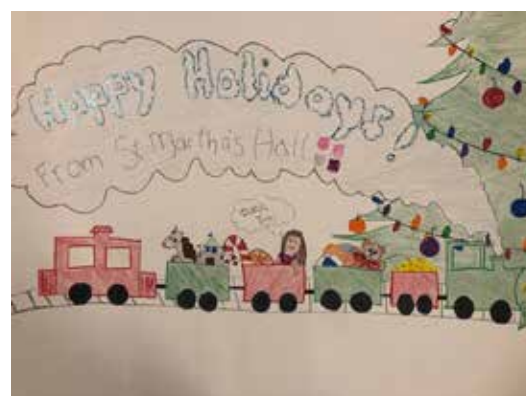
Artwork by: St. Gabriel the Archangel 8th grade girls